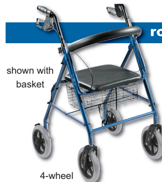
shown with basket