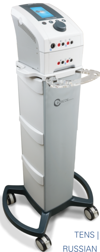
TENS | NMS | IF RUSSIAN | HIGH VOLT MICROCURRENT